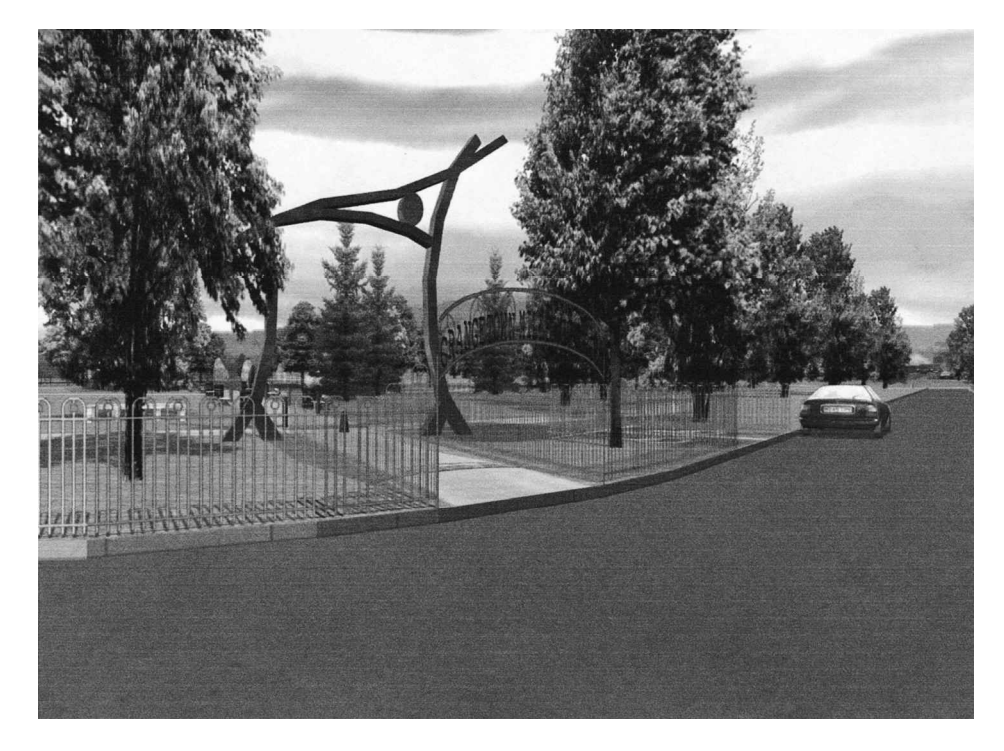
FIG. 1. Screendump of the VE used for the VR exercises.

PWD were seated next to their carer/keyworkers and a research assistant (RA) throughout the VR session, and postural demands were reduced by seating participants in comfortable chairs during the