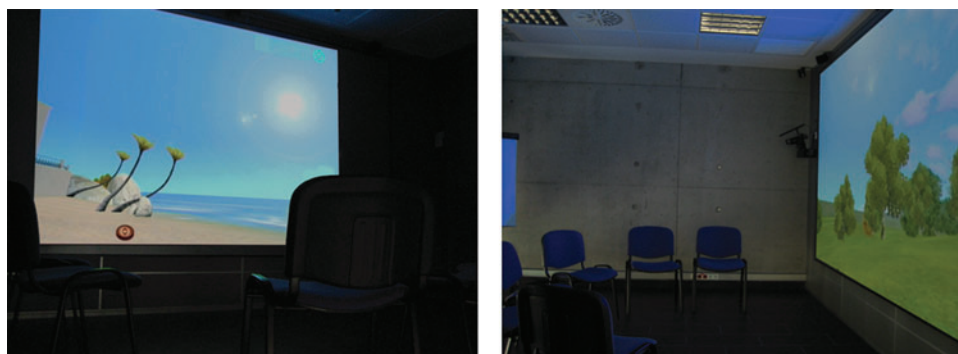
FIG. 1. Treatment setting for the delivery of virtual reality (VR) sessions for training in relaxation and mindfulness skills in a group format. Color images available online at www.liebertpub.com/cyber

The application used in this research is called Engaging Media for Mental Health Applications (EMMA's) World and