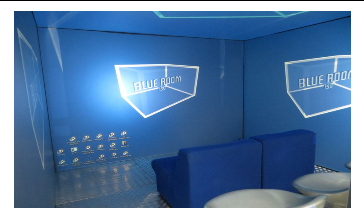
Fig. 1 Picture of the Blue Room virtual reality environment

following link shows a session in progress: https://www. youtube.com/watch?v=9U-rRC8jc28.